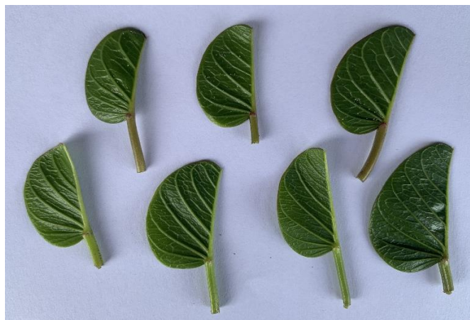
Figure 4.7. Katang-katang Plant Leaves ( Ipomoea pes-caprae ) A total of 7 leaves as a condition. (Documentation: Private).