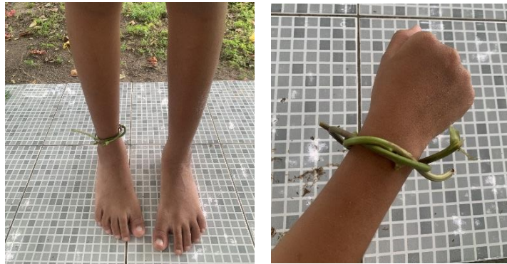
Figure 4.8. The stem or roots of the Katang-katang plant ( Ipomoea pes-caprae ) are tied to the feet and hands of babies/toddlers. (Documentation: Private).