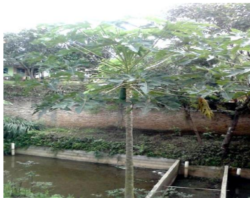
Figure. 1 Plant Papaya