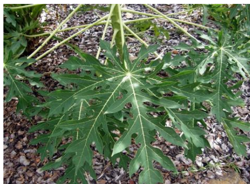
Figure 2. Papaya