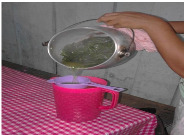
Figure 4. Water Filtration Process