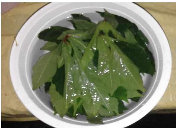
Figure 2. Selection & Washing Process