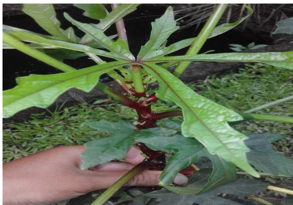
Figure 1. Red Gedi