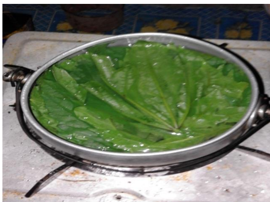
Figure 3. Boiling Process