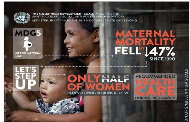
Figure 3. Improve Maternal Mortality Health.

Nine in every 10 contraceptive users were using effective methods, including condoms, injectables, intrauterine devices, female and male sterilisation, oral hormonal pills, or an implant.