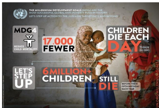
Figure 1. Achievements Of Reducing Child Mortality.

Nearly 84 percent of children across the globe received at least one dose of measles containing vaccine in 2013 – a 73 percent increase since 2000.