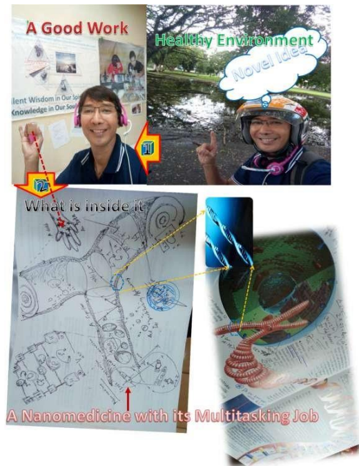
Figure 1. An illustration and its prompt explanation of how a multitasking nanomedicine can improve human health.

In this volume of Nanomedicine and Its Multitasking Applications: A View for Better Health , we present how a nanomedicine can heal many different problems in human body in a time of working or interacting with human cell as shortly depicted in Fig. 1 . By learning from how human body conducts a multitasking job controlled by their thought and gets advices from their spirit in their heart, one proposes a multitasking nanomedicine that can be inserted into human body firstly from their mouth just like drinking a pill, and the capsule